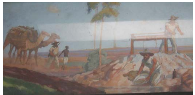
Philip Griffiths Architects 2010