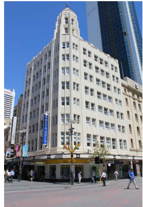
Philip Griffiths Architects 2010

Criteria Applicable Insert Criteria (e.g. N1)