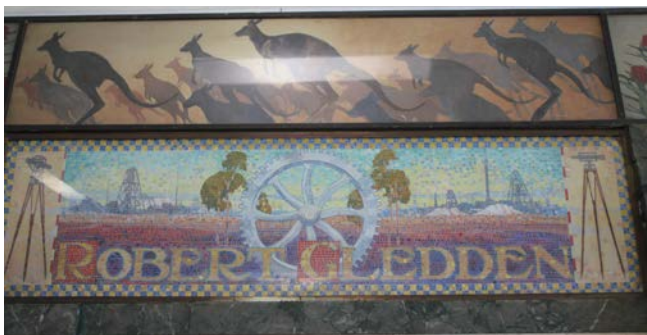
Philip Griffiths Architects 2010