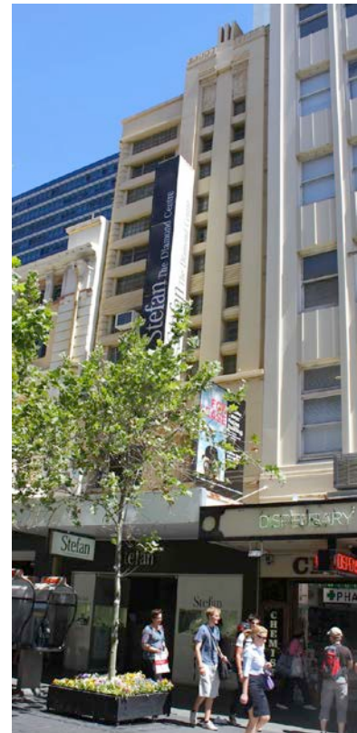
Philip Griffiths Architects 2010