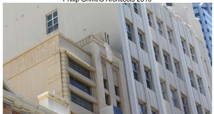
Philip Griffiths Architects 2010