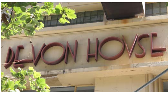
Philip Griffiths Architects 2010