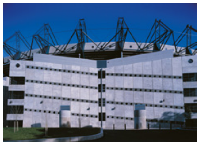
Exterior View of the Southern Stand, Jackson Architecture