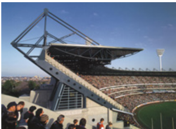
Side view of the Southern Grandstand, John Gollings