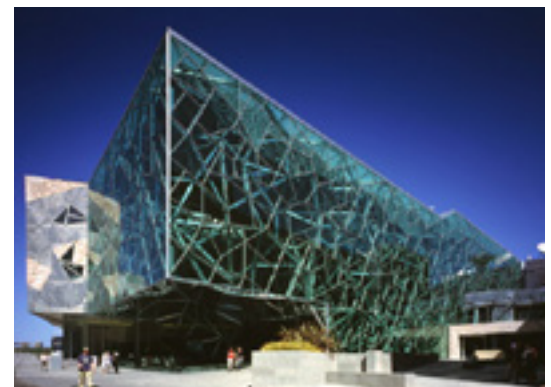
View of the atrium entrance from Flinders Street, fedquare.com