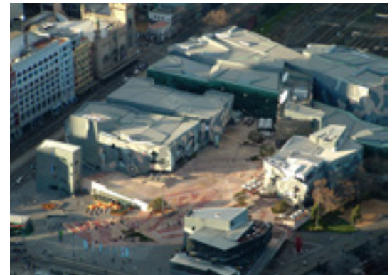
Oblique aerial of Federation Square site, wikipedia