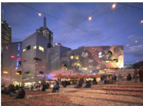
Twilight view from within Federation Square, looking toward, arcadis.com