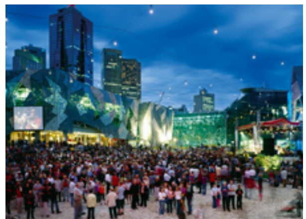
Twilight view from within Federation Square