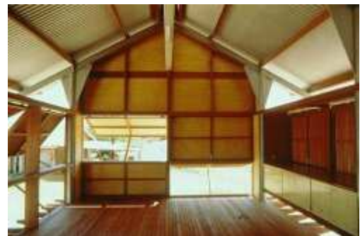
Internal view main living area