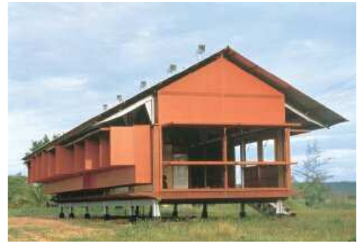
East end (facing community)

Criteria Applicable N1– Significant heritage value in demonstrating principal characteristics of a particular class or period of design. N2 – Significant heritage value in exhibiting particular aesthetic characteristics. N3 – Significant heritage value in establishing a high degree of creative achievement. N5 – Having a special association with the life or works of an architect of significant importance in our history.