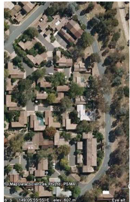
Swinger Hill