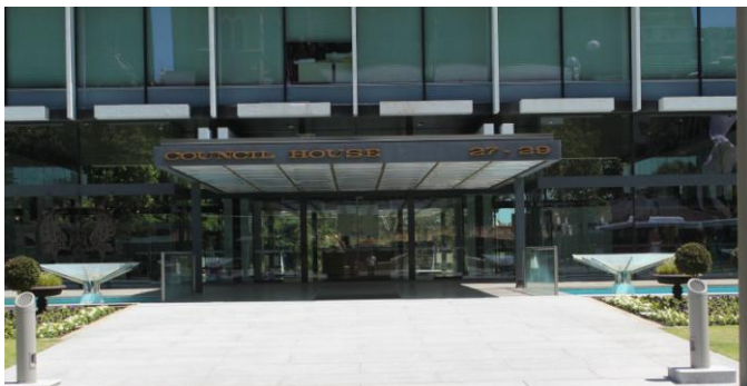
Philip Griffiths Architects 2010