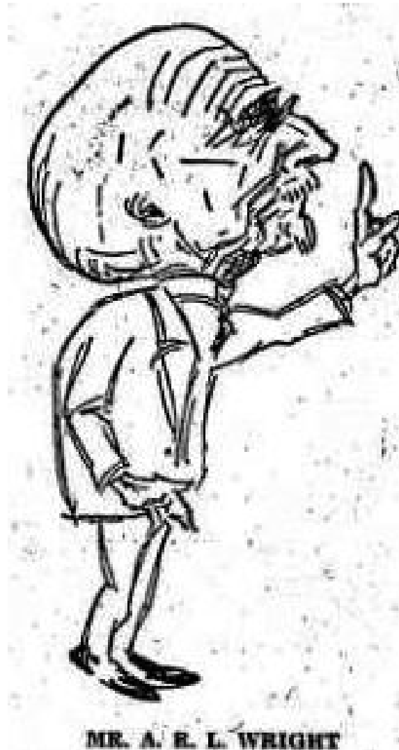
Alfred Wright caricature accompanying an article titled 'Lifetime of Architecture' ( Daily News , 23 March 1929, p.6).