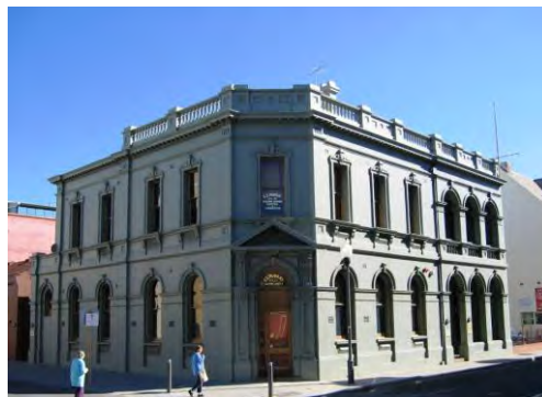
Union Bank of 1889 on the corner of High and Cliff Streets, Fremantle