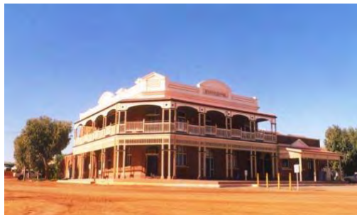
State Hotel at Gwalia of 1903.