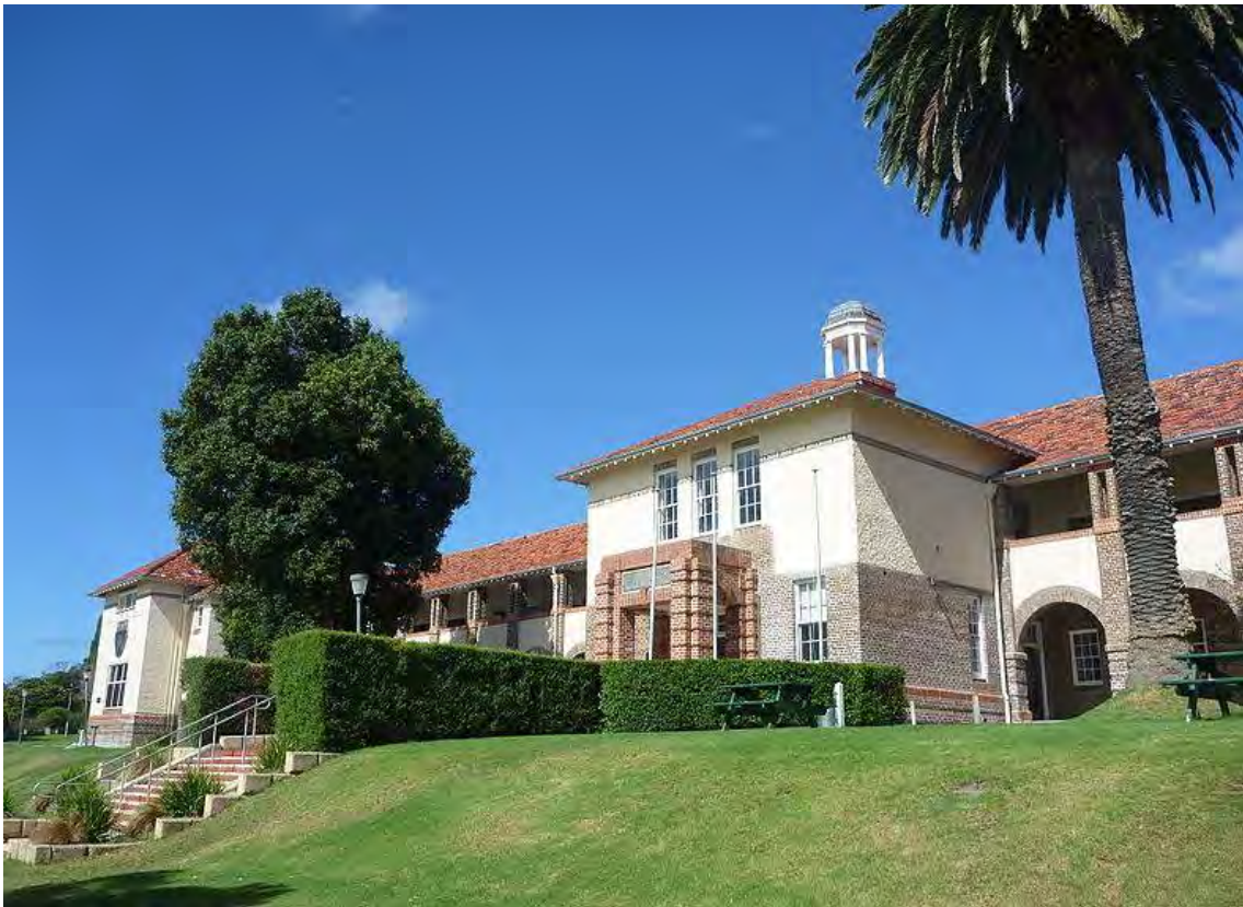
Albany Senior High School