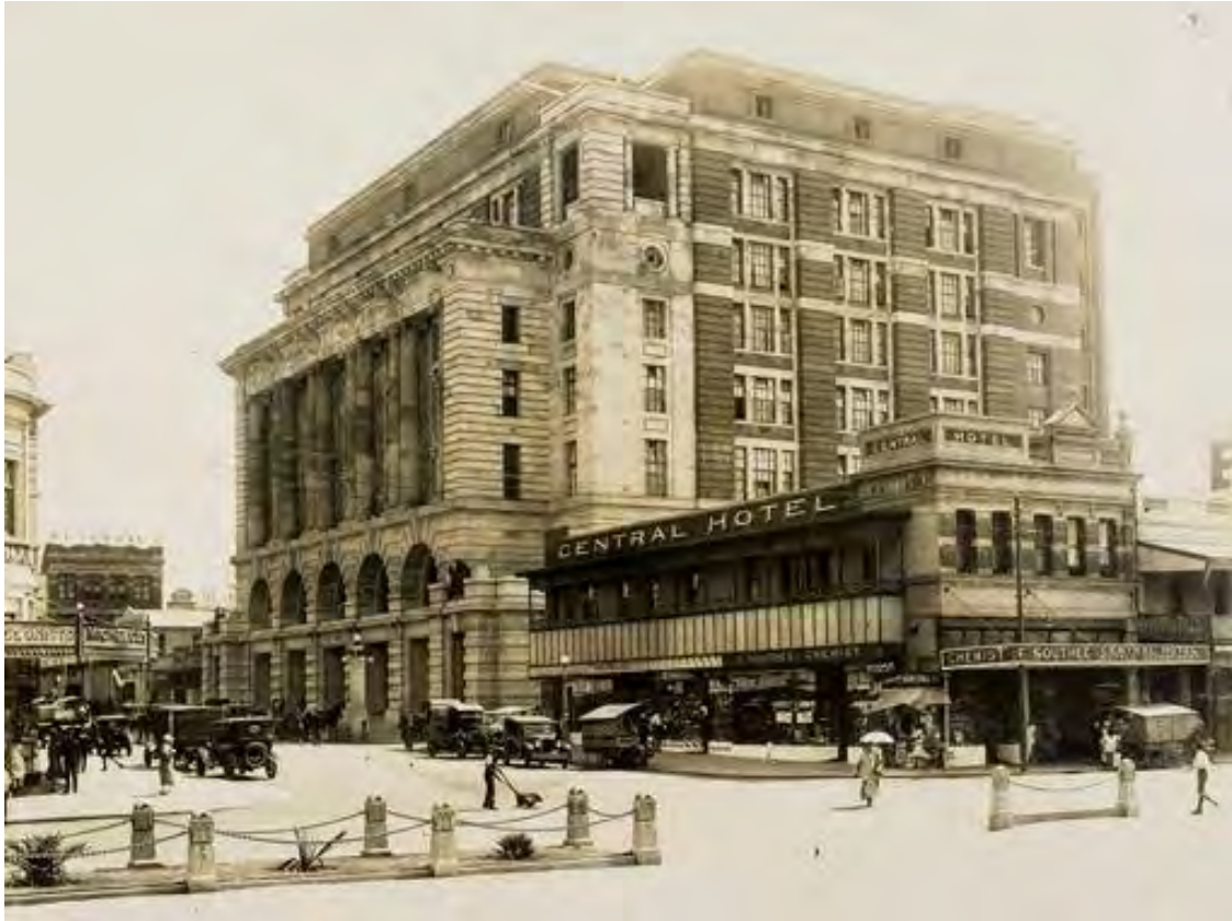
GPO Perth c1929