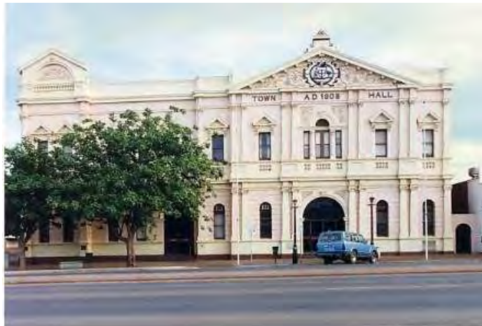
Kalgoorlie Town Hall & Council Chambers of 1908 (HCWA Pic3075)