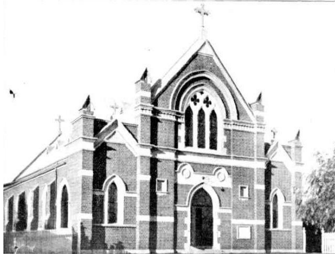
St John's Anglican Church, Maritana Street, Kalgoorlie ( Western Mail , 1 May 1909, p.27)