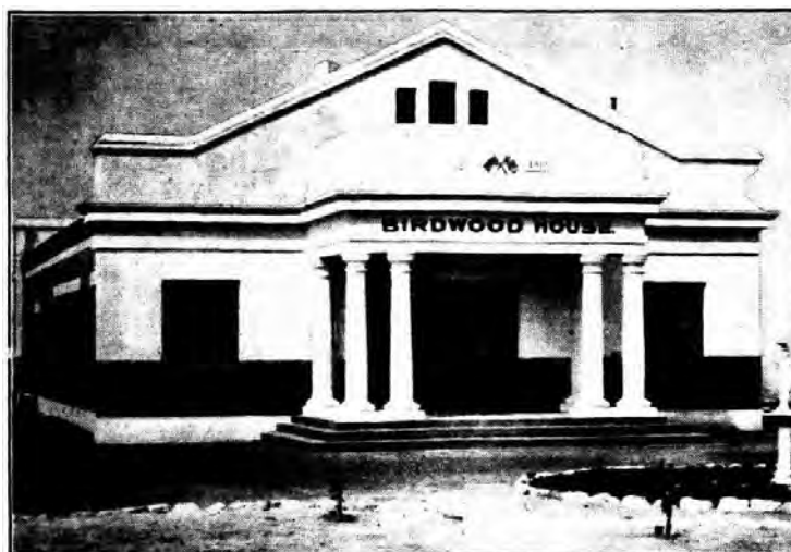
Birdwood House, Chapman Road, Geraldton of 1935 ( Geraldton Guardian and Express , 3 September 1935, p.3)