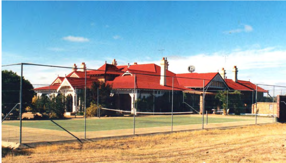
Hardie Family homestead Wallinar, Broomehill built in 1911.