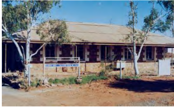
Roebourne School of 1892 (Dept of Environment barcode rp03571)