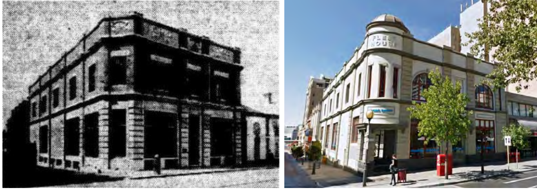
The showroom-offices Oldham designed for H.V. McKay Pty Ltd on the north-east corner of Murray & King Streets, Perth in 1924 have been highly modified. Oldham also designed a large factory for the company at Crawford Road, Maylands in 1926. ( The West Australian , 28 March 1925 p.14, Google 2014).