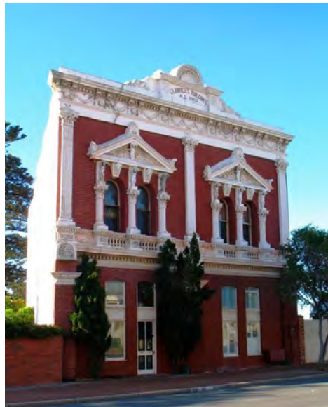
Glanville's Buildings on Canning Highway, East Fremantle

Smith Street Fitzroy 1888 ( Australasian Builder and Contractors' News , 22 September 1888)