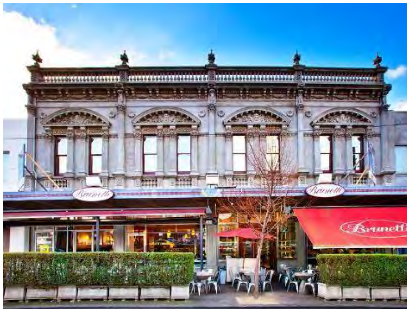
Shops and residences at 198-204 Faraday Street, Carlton of 1886 ( http://www.commercialrealestate.com.au/property/7754871/for-lease/vic/carlton/retail )