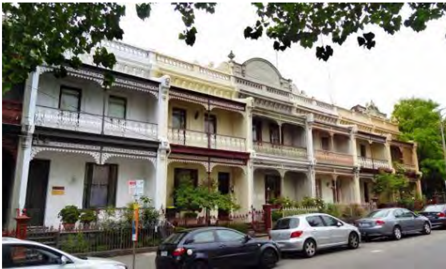
Melbournia Terrace 1-13 Drummond Street, Carlton of 1877