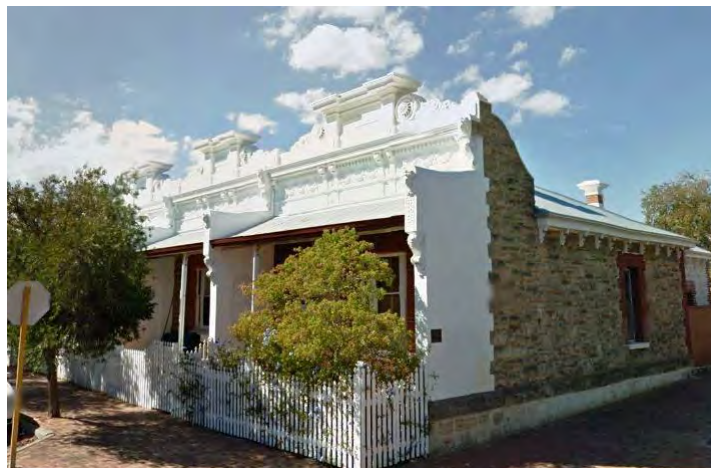
Attached housing at 46-52 King Street, East Fremantle (Google 2014)