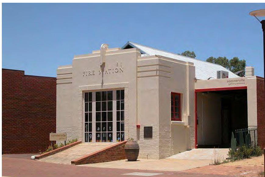
Toodyay Fire Station of 1939.