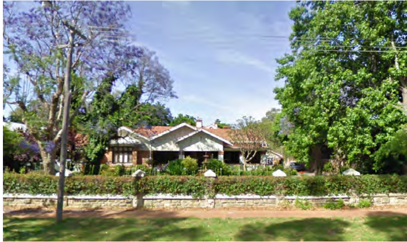
It is likely that 19 Market Street, Guildford is a 1923 example of Duncan's work (Google 2013)