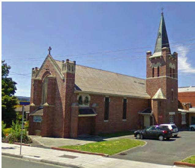
St Mary's Church, Springfield Avenue, Moonah, Tasmania of 1924