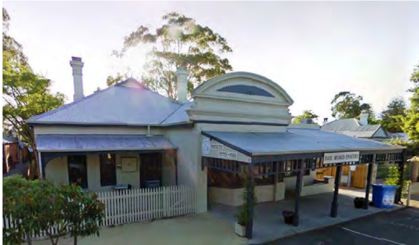
Shop-dwelling in Bay Road, Claremont WA of 1906, now Bay Road Pantry (Google 2012)