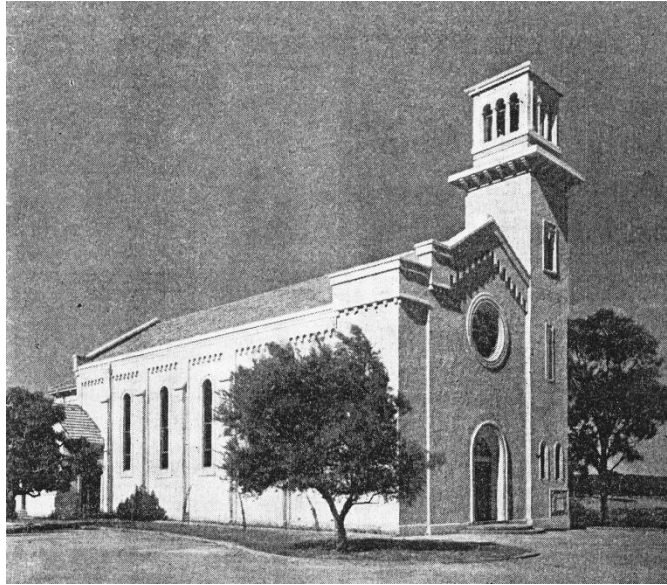
Exterior of Clontarf Chapel of 1941 ( The Record , 25 Dec 1941, p.12).