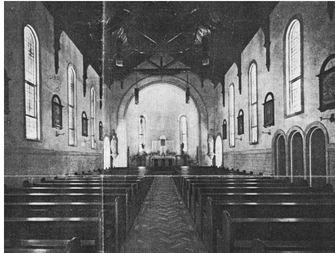
Interior of Clontarf Chapel of 1941 ( The Record , 25 Dec 1941, p.11).