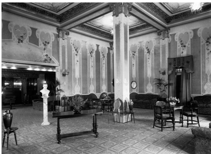
The Capitol Theatre, William Street, Perth in 1931 (SLWA 101412PD, SLWA 101413PD).