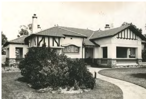
Old York Fire Station of 1897 (Google 2014); Riverina 43 The Esplanade South Perth of 1920 (Richard Mouritzen)