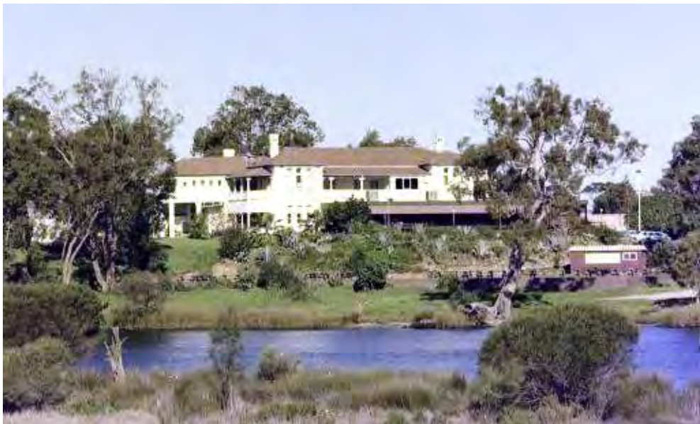
The Ascot Hotel (Inn) at Epsom Avenue, Belmont in 1977 (SLWA 328285PD)