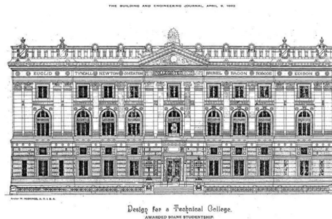
Elevation submitted by Hoskings for Soane Studentship ( Building & Engineering Journal , 9 April 1892)