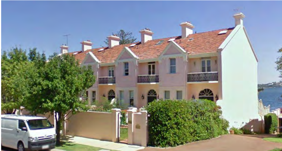
Matheson's Terrace, later Bayview Mansions, Victoria Avenue Claremont