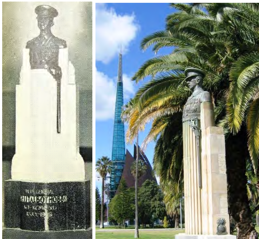
Portion of model for the Hobbs Memorial, Perth which was unveiled on Remembrance Day 1940.