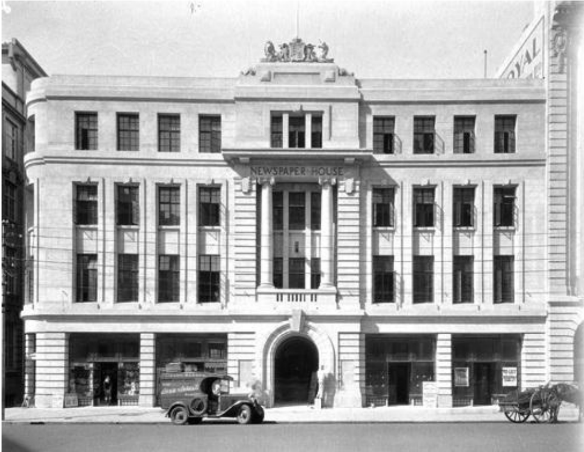
Newspaper House (1932) in St George's Terrace, Perth (SLWA 095206PD).