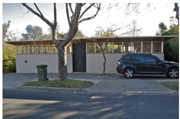
Street view.