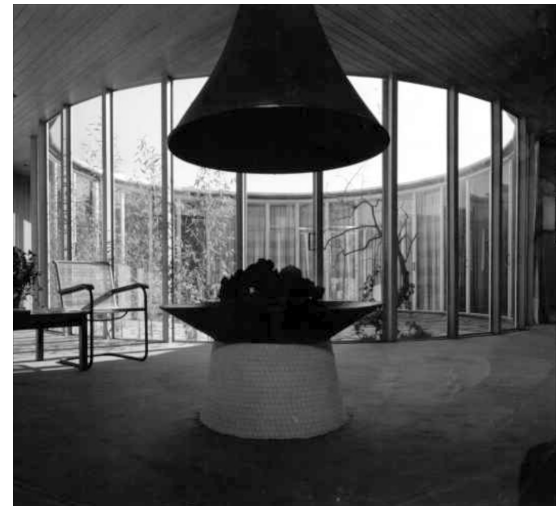
Courtyard from living room 1953. [SLV Pictures]