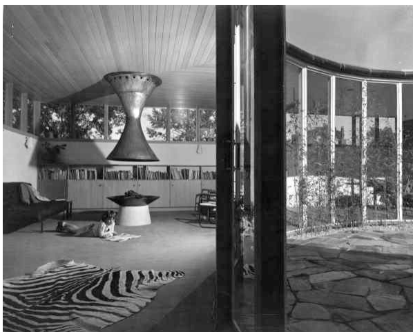
Living room from entry area 1953.