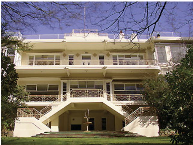
Garden elevation.

N6 - Significant heritage value in demonstrating a high degree of technical achievement of a particular period.