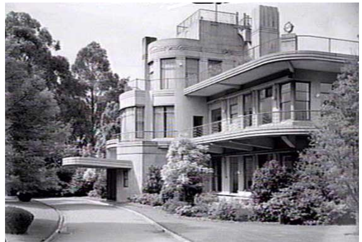
View from driveway, 1947.