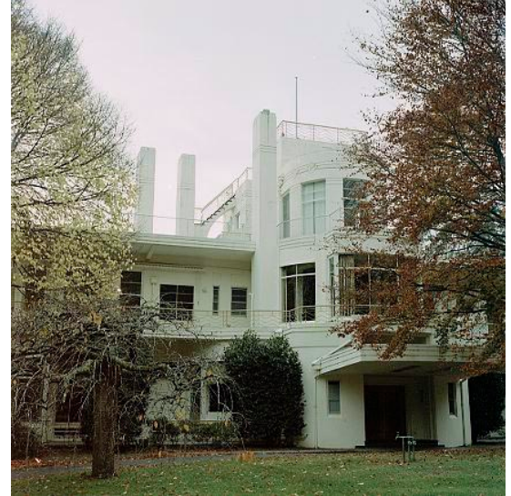
Front entrance.

Statement of Significance The use of the Moderne style at Burnham Beeches is a particularly early example and reflects contemporaneous developments in American architecture. It is a successful synthesis of the ornament and styling of the 1920's Jazz period with Streamlined Moderne which was to become popular in the 1930's in Australia. Burnham Beeches is a rare domestic example of the Moderne genre.